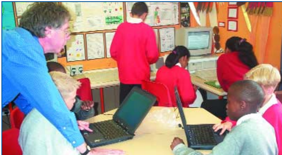
Primary pupils use laptops wirelessly linked to the school network